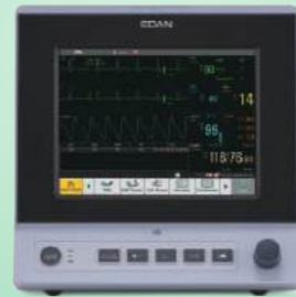
X8 Patient Monitor